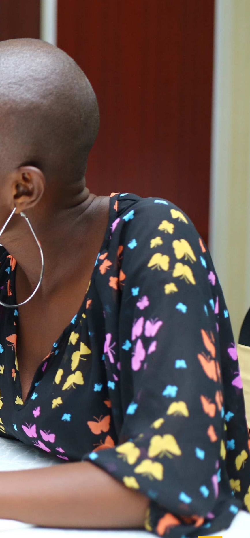
The Youth Congress Annual Report 2021 29

<sup>44</sup> Youth are reshaping the present, and creating a better future 1