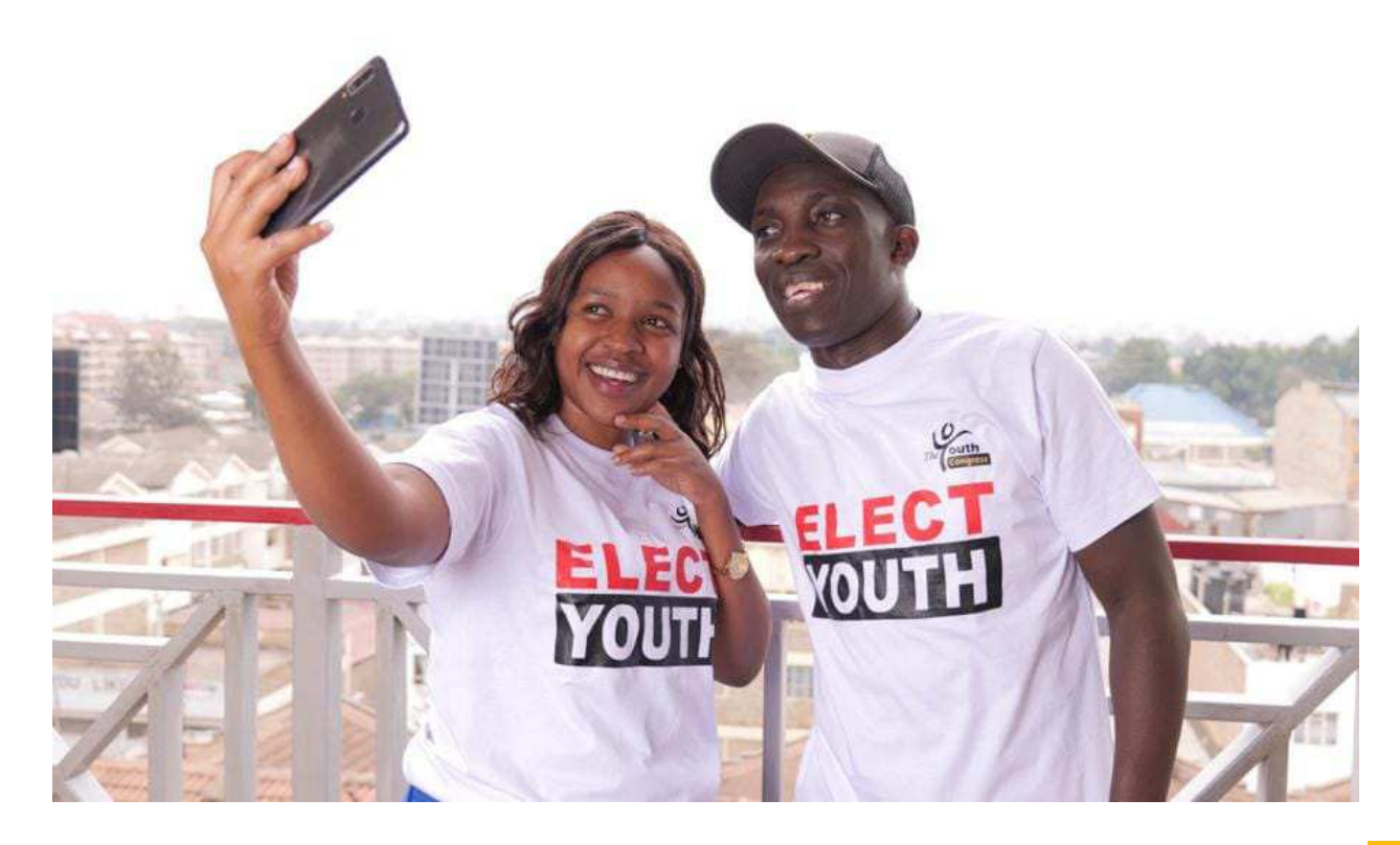
The Youth Congress Annual Report 2021

The Youth Congress was also incorporated into the I.E.B.C Youth Coordinating Committee, whose objective was to involve youth organizations in collaboration and institutional commitments to support voter registration and education for the 2022 General Election.