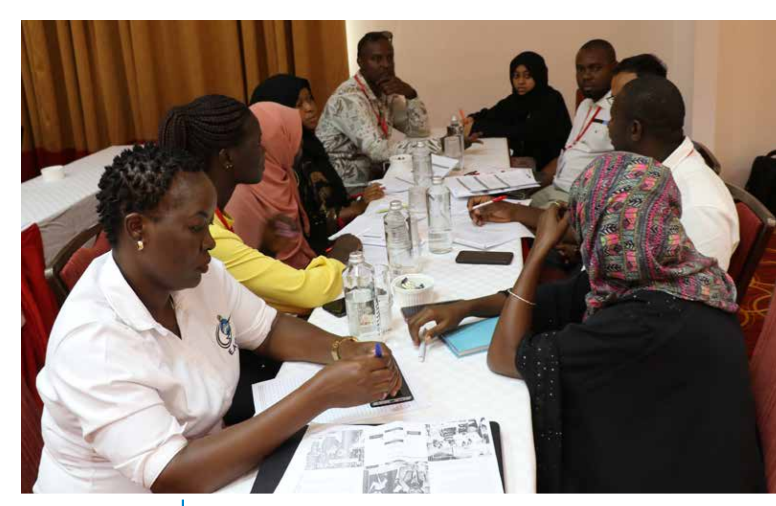
Delegates deliberating on Tourism, Bioprospecting & Fishing

The World Bank, through the State Department of Fisheries & Blue Economy and Kenya Fisheries Service, purposed to grant KES 4.96 billion to the County Governments of Mombasa, Kwale, Kilifi, Tana River, and Lamu for the purposes of supporting the Kenya Marine Fisheries & Socio-Economic Development Project (KEMFSED) whose purposes is to enable the region obtain the maximum and sustainable economic benefit from coastal and marine resources.