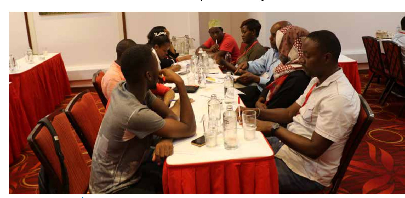
Delegates deliberating on Sustainable Maritime Transport, Logistics & Security