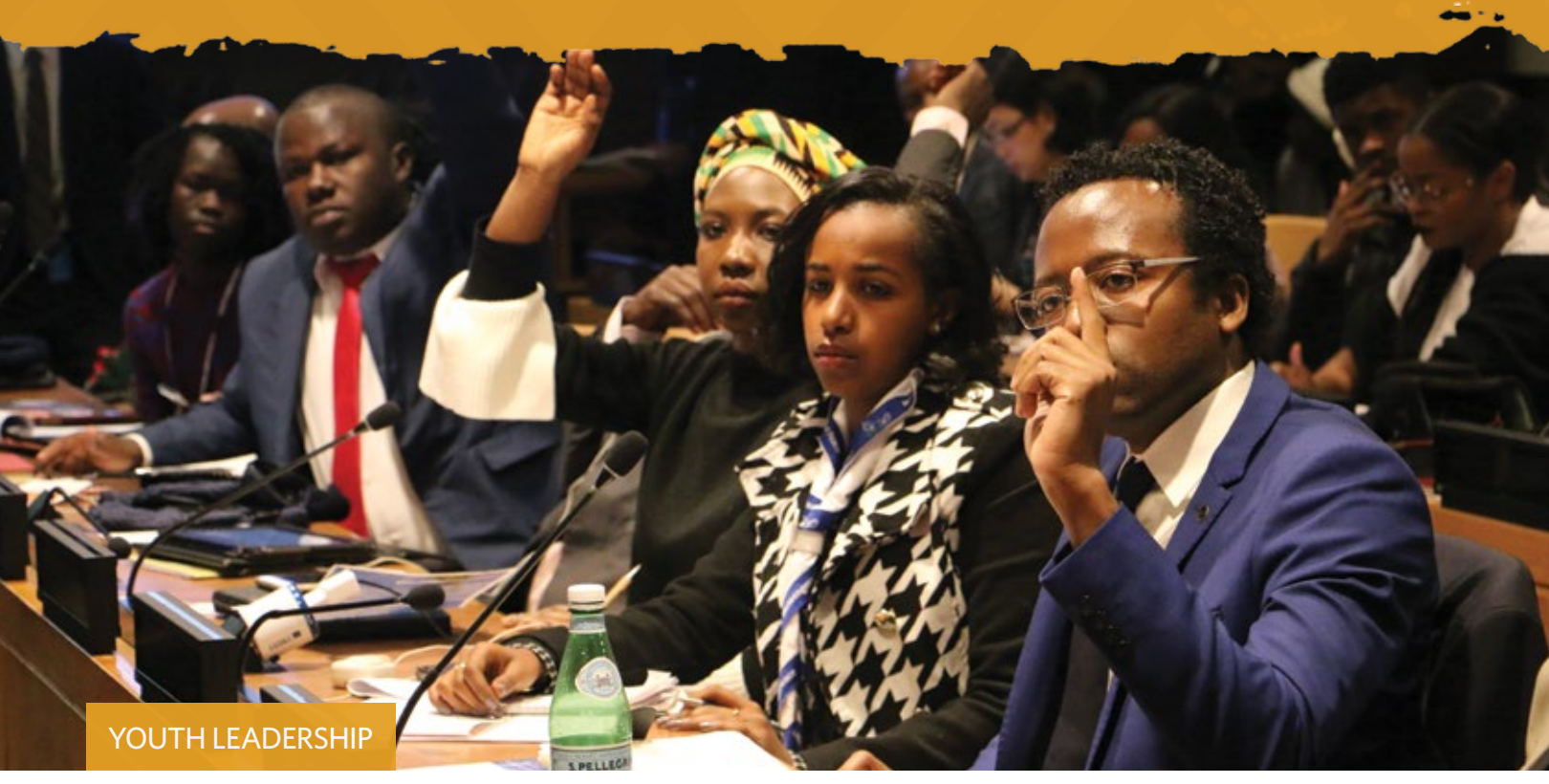
African youth participate at an international youth forum at the UN headquarters in New York.

African youth are relying on technology and improved leadership and organising skills to mobilise for social change and to demand a seat at the table. In this edition, we explore the factors driving the continent's emerging young leaders and why they are increasingly influential in society.