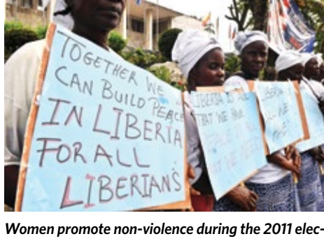
tions in Liberia.

supporting organizations. Articles from this magazine may be freely reprinted, with attribution to the author and to "United Nations Africa Renewal," and a copy of the reproduced article would be appreciated. Copyrighted photos may not be reproduced.