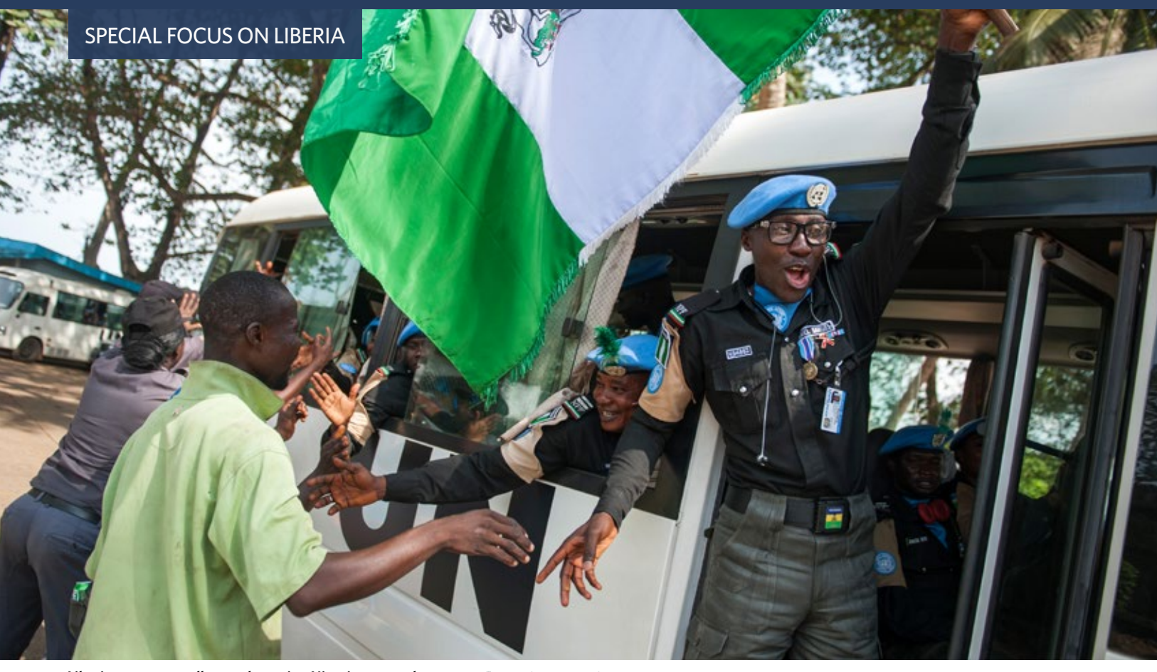
Liberians wave goodbye to departing Nigerian peacekeepers. 🗂 UN Photo/Gonzalez Farran